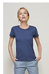
SOL'S CRUSADER WOMEN 03581